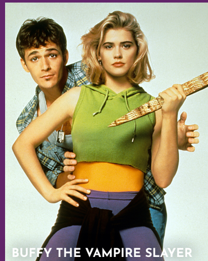
BUFFY THE VAMPIRE SLAYER