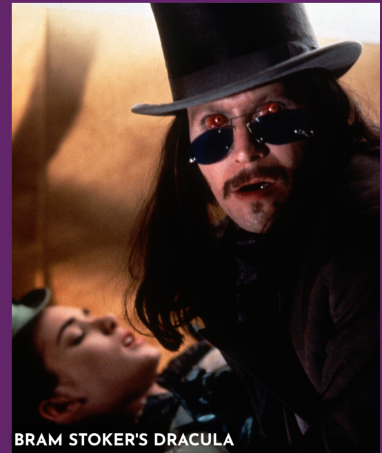
BRAM STOKER'S DRACULA