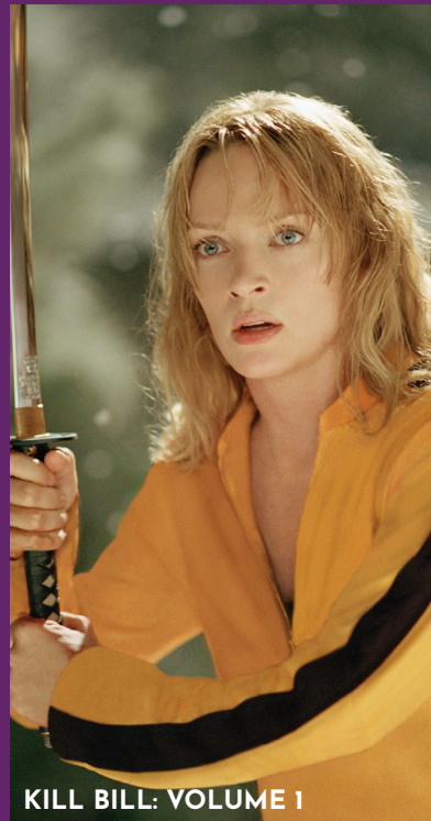
KILL BILL: VOLUME 1

Saturday, 10/26: Halloween Horror Marathon