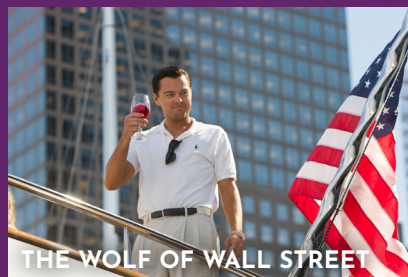
THE WOLF OF WALL STREET