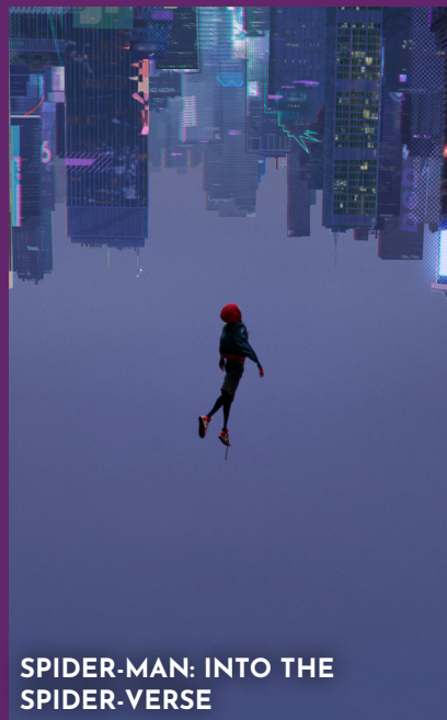
SPIDER-MAN: INTO THE SPIDER-VERSE