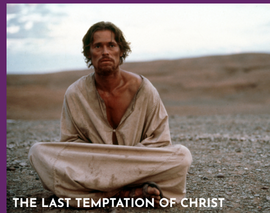
THE LAST TEMPTATION OF CHRIST