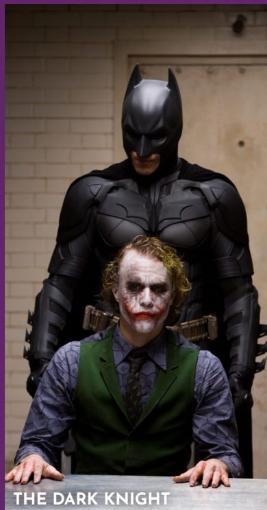
THE DARK KNIGHT