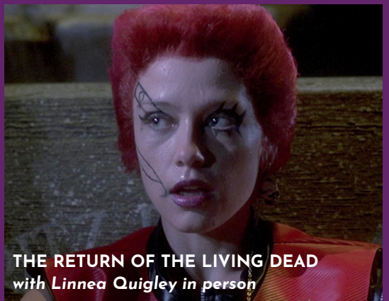
THE RETURN OF THE LIVING DEAD with Linnea Quigley in person