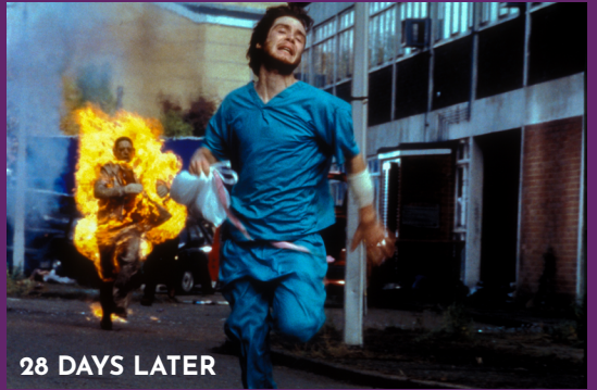
28 DAYS LATER