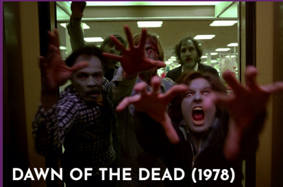
DAWN OF THE DEAD (1978)