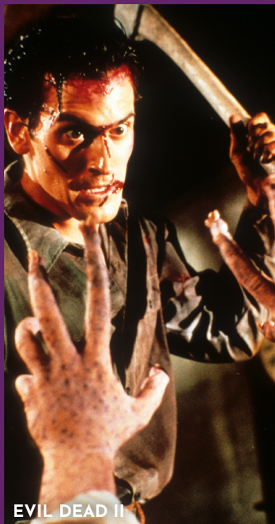
EVIL DEAD II