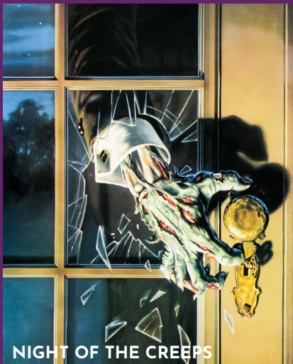
NIGHT OF THE CREEPS