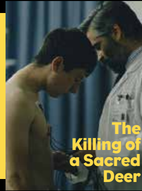
The Killing of a Sacred Deer