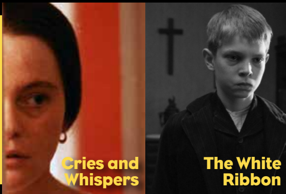
Cries and Whispers