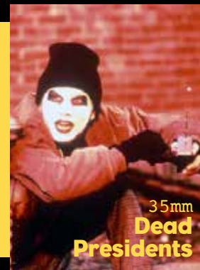
35mm Dead Presidents