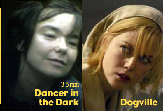
35mm Dancer in the Dark