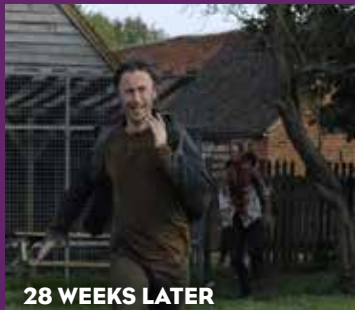
28 WEEKS LATER