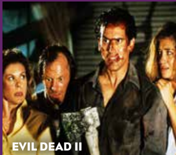
EVIL DEAD II