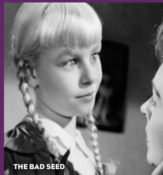
THE BAD SEED