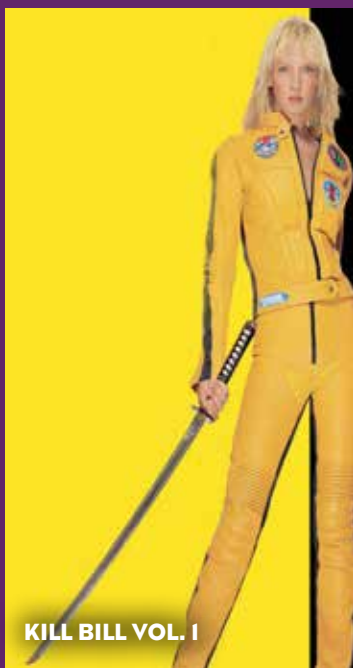
KILL BILL VOL. I