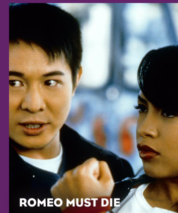
ROMEO MUST DIE