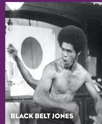
BLACK BELT JONES