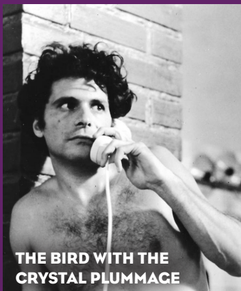
THE BIRD WITH THE CRYSTAL PLUMMAGE