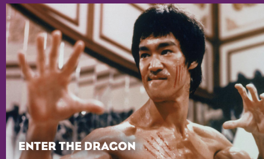
ENTER THE DRAGON