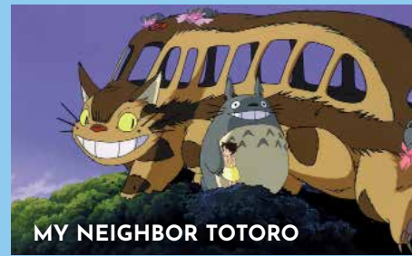
MY NEIGHBOR TOTORO