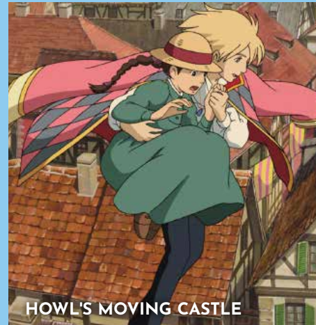
HOWL'S MOVING CASTLE