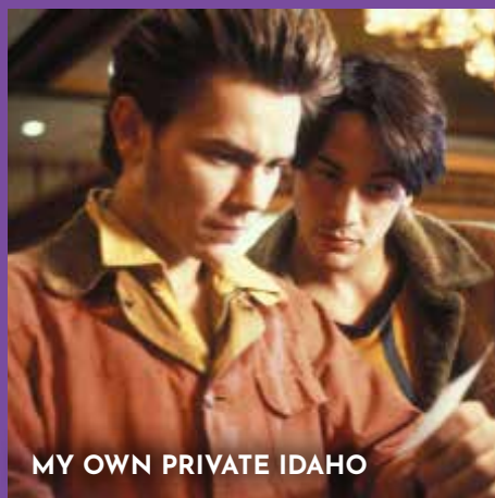
MY OWN PRIVATE IDAHO