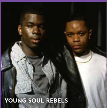
YOUNG SOUL REBELS