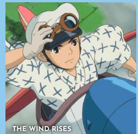
THE WIND RISES