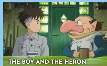
THE BOY AND THE HERON