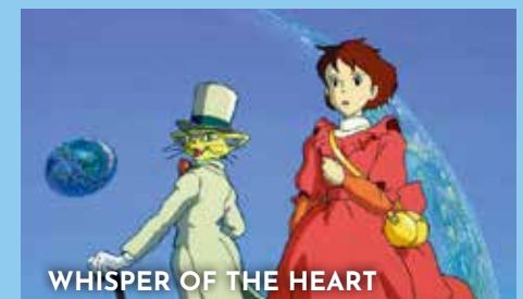
WHISPER OF THE HEART