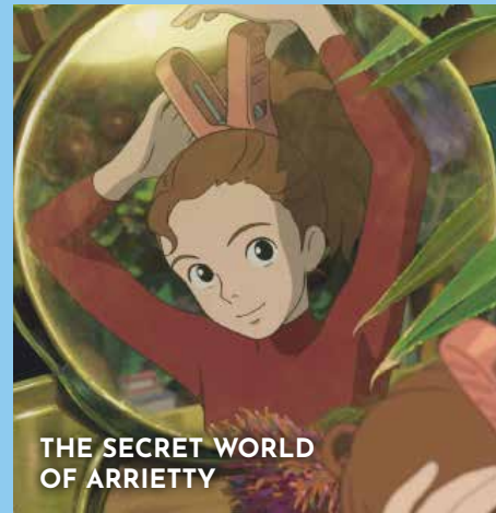
THE SECRET WORLD OF ARRIETTY