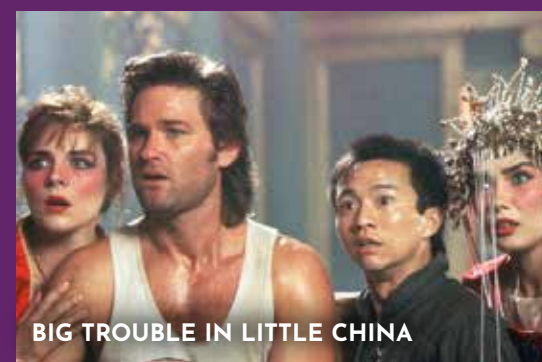
BIG TROUBLE IN LITTLE CHINA