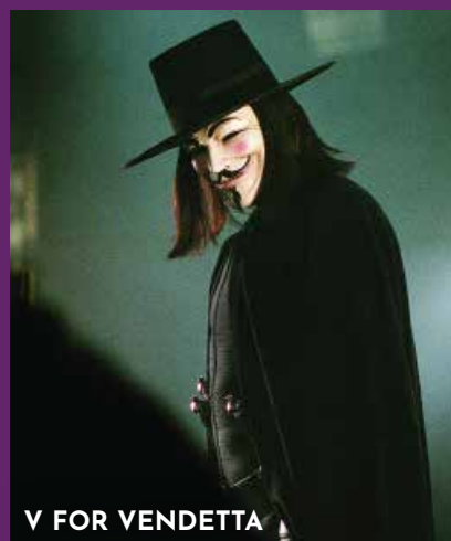
V FOR VENDETTA