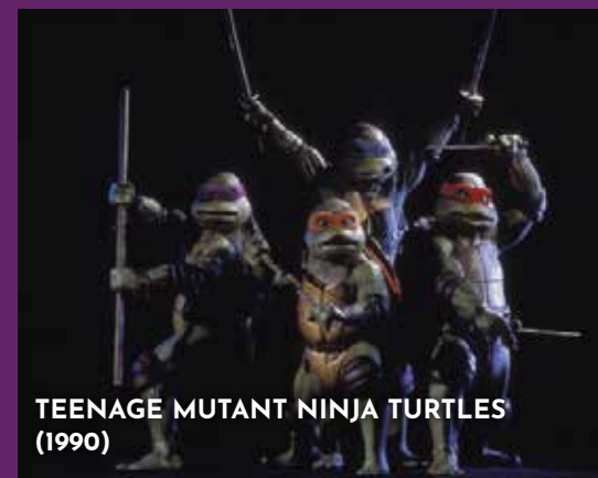
TEENAGE MUTANT NINJA TURTLES (1990)