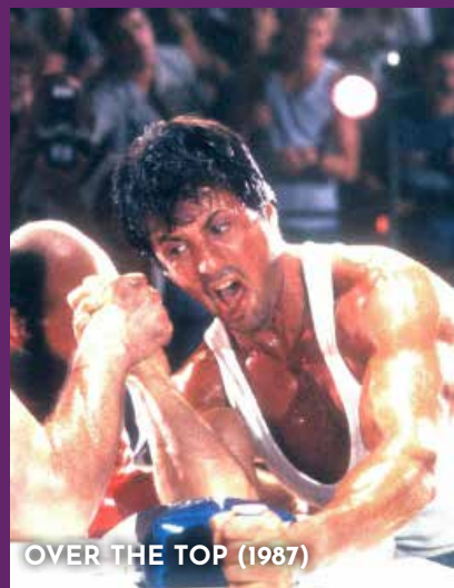
OVER THE TOP (1987)