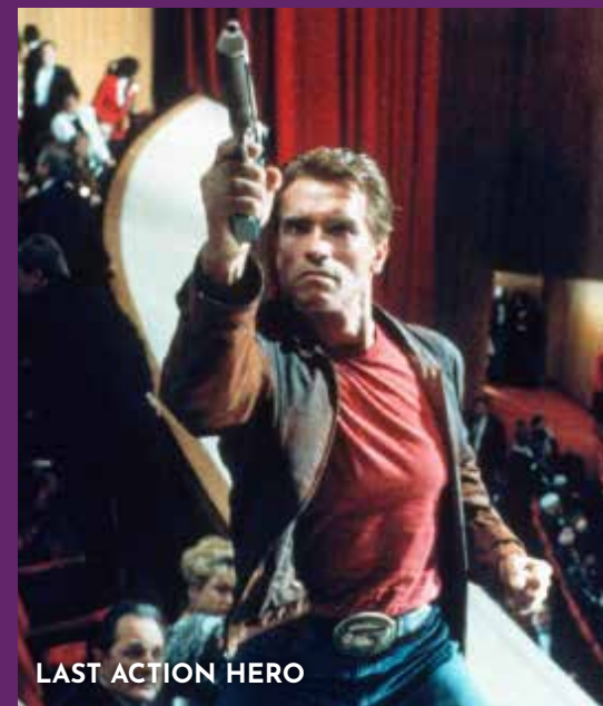
LAST ACTION HERO