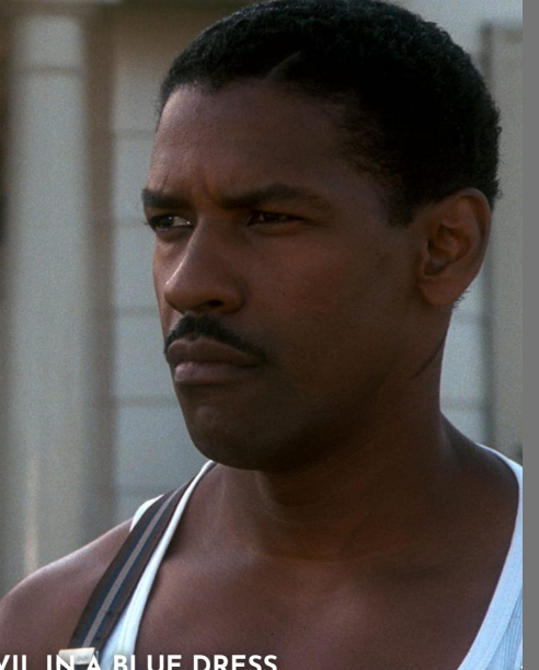
DEVIL IN A BLUE DRESS