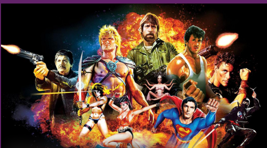
THE COLOSSAL CANNON FILMS 35MM TRAILER SHOW!