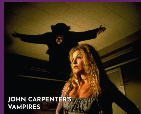
JOHN CARPENTER'S VAMPIRES