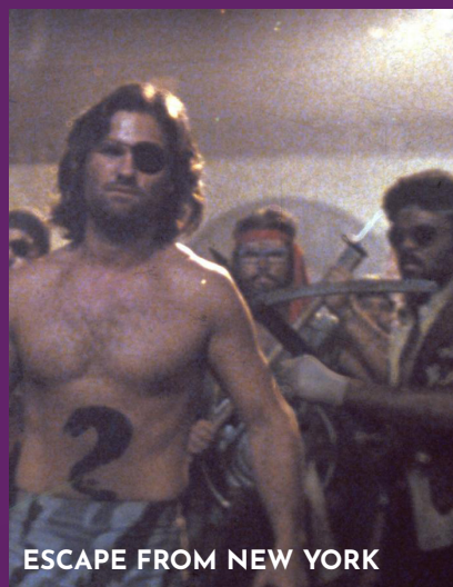
ESCAPE FROM NEW YORK