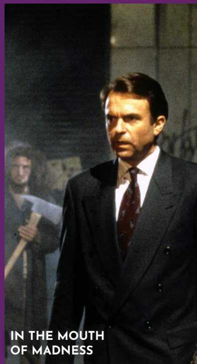
IN THE MOUTH OF MADNESS