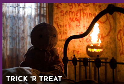
TRICK 'R TREAT