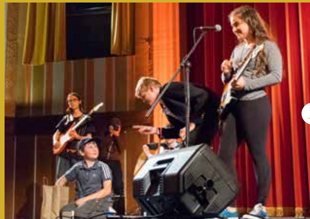
① Students from the Brookline Music School performing before a Cinema Jukebox® presentation of Pink Floyd: The Wall

We put on outdoor screenings of Back to the Future , King Kong , and Twister as part of the third year of our Coolidge at the Greenway partnership