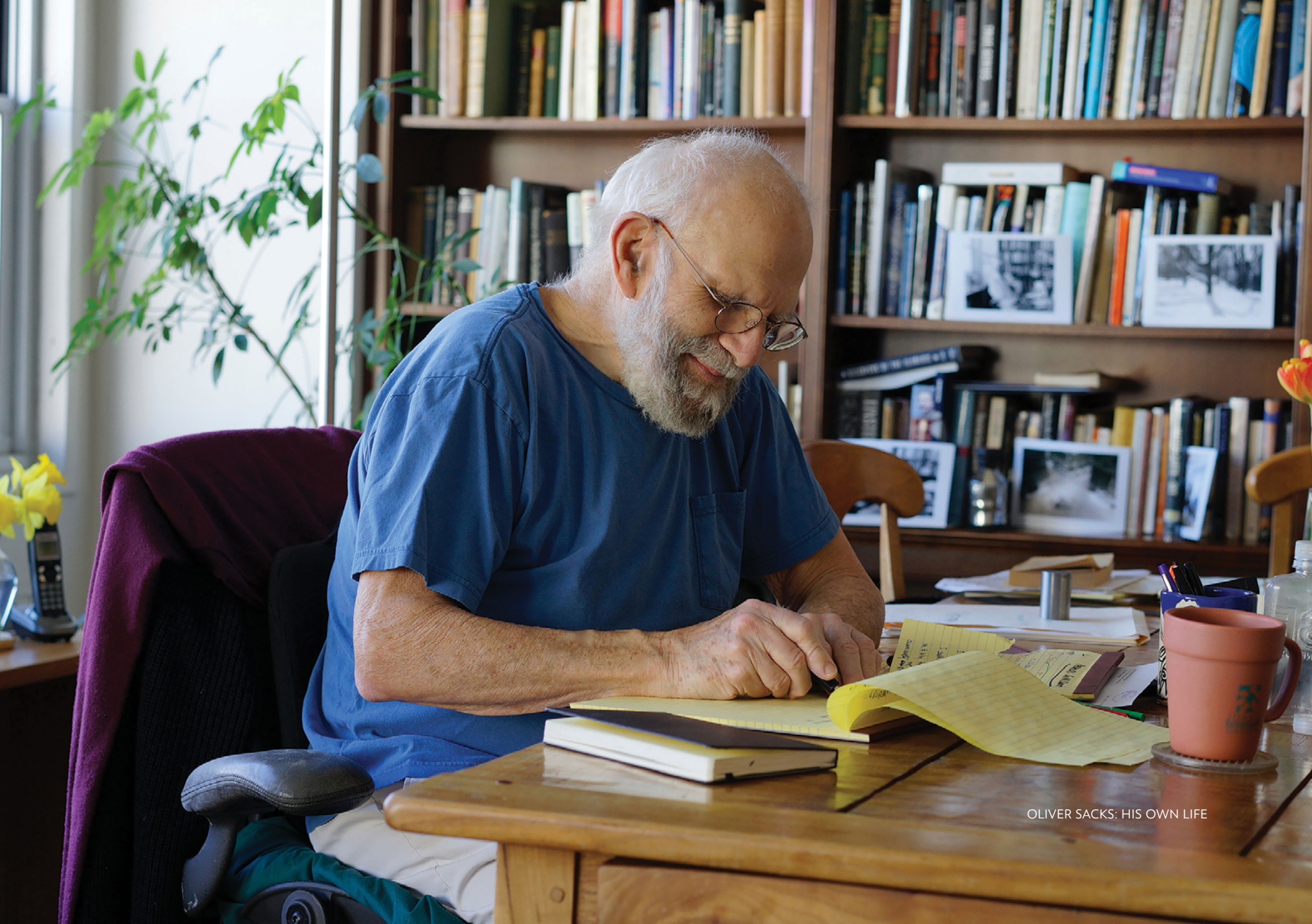
OLIVER SACKS: HIS OWN LIFE