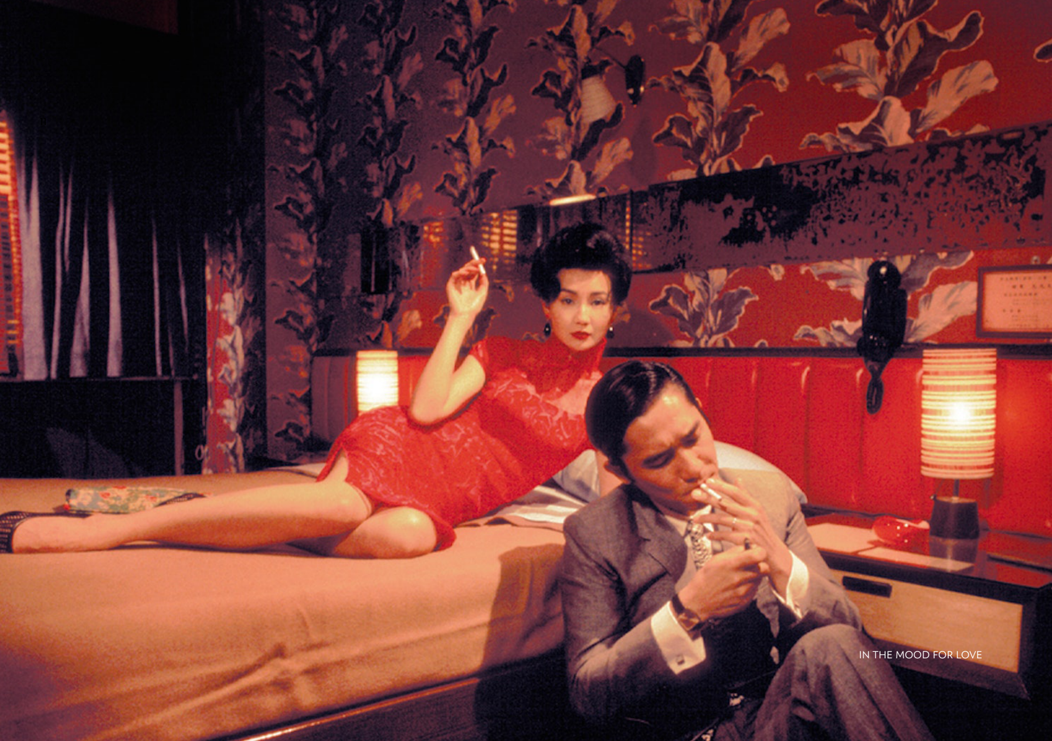
IN THE MOOD FOR LOVE